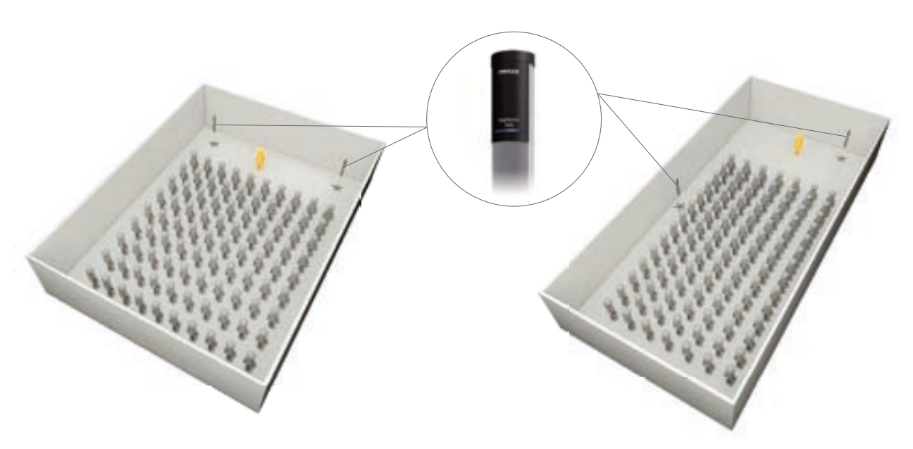
Recommended configuration for square rooms