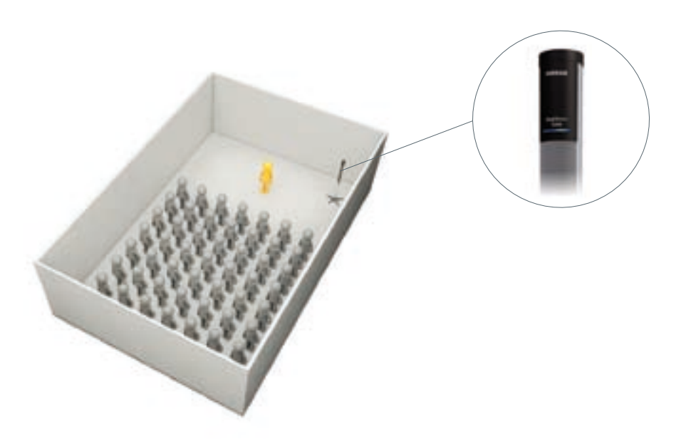
Recommended\ configuration\ for\ regular\ sized\ rooms